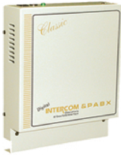
4, 8, 12 & 16 Lines