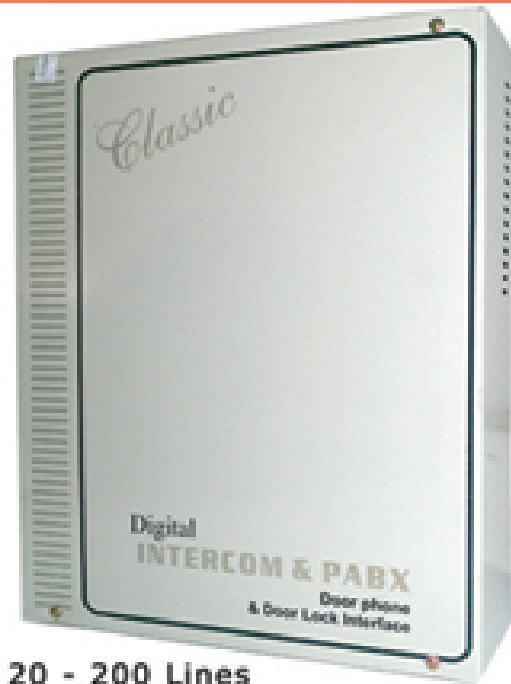
20 - 200 Lines